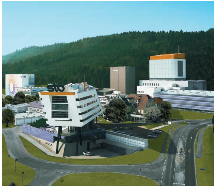
Head office Sto, Black Forrest, Germany.

As the authorized partner of Sto for Australasia, Stoanz Ltd is committed to the Sto philosophy. Today having developed a full range of Sto plaster systems that have been tested and certified by BRANZ for the New Zealand market, Sto is recognized as a leader in the plaster facade and cladding market.