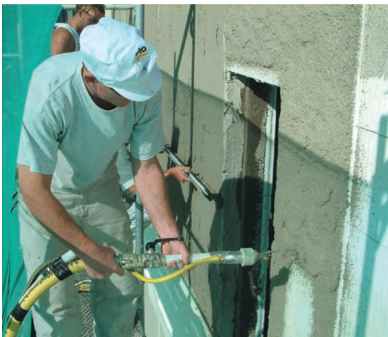
Step 2: application of the finishing render by a Sto applicator.