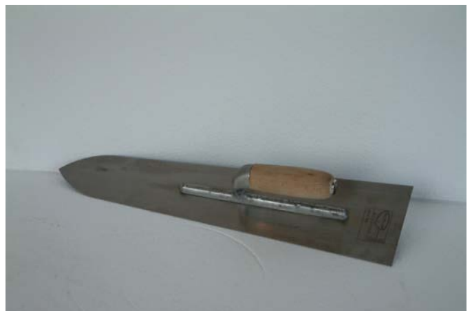
StoArmat Miral on EPS block construction.

Finally once cured, a registered Sto applicator applies the required Sto plaster system incorporating a coloured finishing render and facade paint. The Sto plaster systems are quick in their installation and complement the EPS block construction with Sto detailing and waterproofing componentry. Stos' interior plasters provide a natural aesthetically and durable solution to the traditional gib overlay.