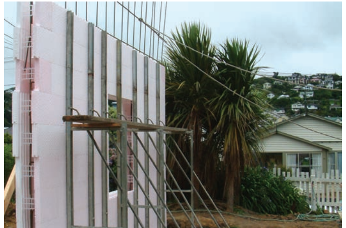
1. Step: setting of EPS blocks

First the blocks are stacked according to the architectural design of the project, after preparations like footings, slabs and reinforcing have been completed. Next openings and bracing are formed before concrete is pored into the EPS block shell. Once dry services are installed ready for the exterior and interior plaster systems.