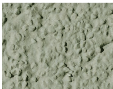
Stolit K 2.0 mm

Coloured self gauging float finishing renders.